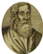
Clement of Alexandria

were condemned as sinners. 45 A commentary of the Didache , the Epistle of Barnabas (written between AD 70-132), said, “You shall love your neighbor more than your own life. You shall not slay the child by abortions. You shall not kill what is generated.” 46